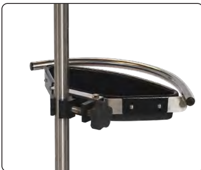
Option - Handle & Tray Insert