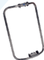
INFUSION PUMP HOOP Holds up to 6 pumps P-1080-F Stainless Steel P-1083-F CuVerro®