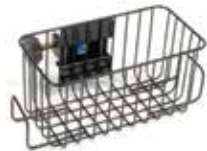
WIRE BASKET P-3201 Large (Stainless) P-3202 Large (Black) P-3211 Med (Stainless) P-3212 Med Black