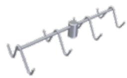
8-HOOK ASSEMBLY Extended IV Hook Assembly P-1080-H Stainless Steel