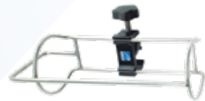
O 2 HOLDER Holds E-size oxygen tanks P-3601 Stainless Steel