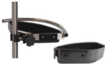
PATIENT HANDLE Adjustable handle provides easy mobility. P-3305 Stainless Steel P-3306 CuVerro® P-3307 Black P-3305-T Tray Insert