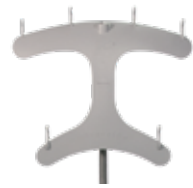
CV HOOK Molded polymer six hook IV assembly P-1090-CV-TH Assembly