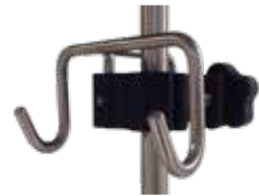
S'MORE HOOK For mounting additional IV bags P-1080-J Stainless Steel