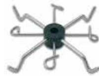
IV SET ORGANIZER Also holds secondary bags P-1080-B Stainless Steel