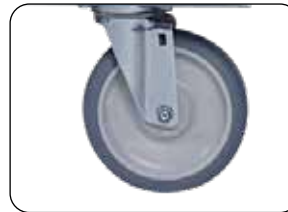
Stainless Steel Caster