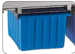
Tote mounted with hanger

17 \frac{3}{4} "L x 14 \frac{1}{2} "W x 5 \frac{1}{8} "D