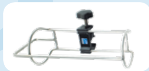
O 2 Tank Holder / E-size