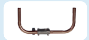
Infusion Pump Holder