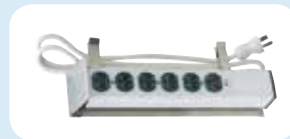
Hospital Grade Outlet