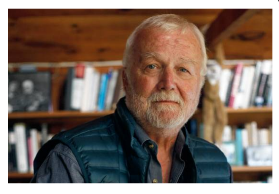
20 ODD QUESTIONS Novelist Russell Banks on Train Travel and Nostalgia-Inducing Hotels