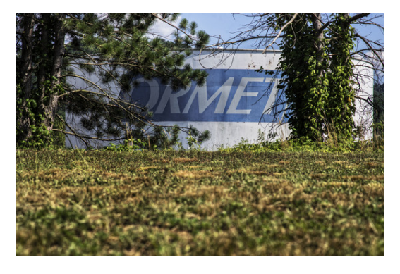
EXPERIENTIAL Ohio Voters Say GOP Convention Did Little to Sway Them