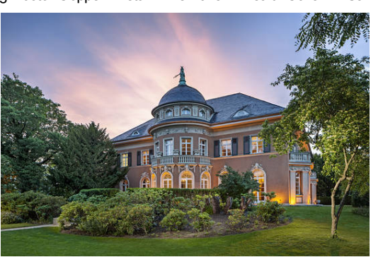
INFOGREX HOUSE OF THE DAY A German Villa With a Cold War History