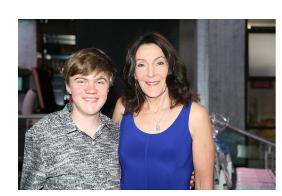
New Voices in Medical Advocacy Often Are Patients