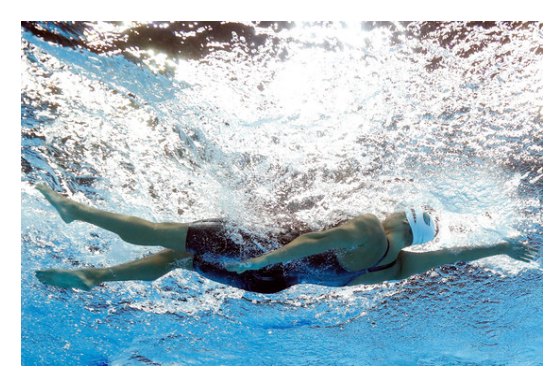
HEALTH & WELLNESS Caffeine: The Performance Enhancer in Your Kitchen