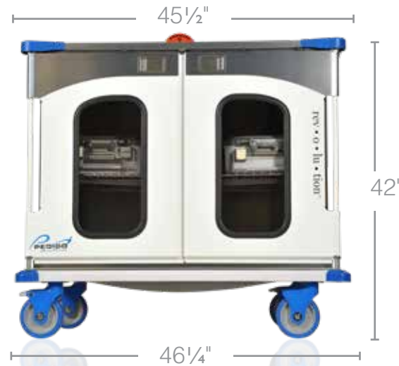
RCC-242 Outside Dimensions: 27½"D x 41½"H x 45½"W (top) / 46¼"W (bottom)