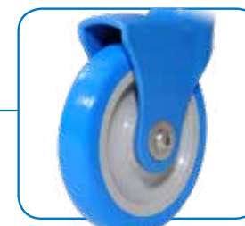
re • volve™ caster

Floor Sloped Toward Rear 1½° slope for containment of fluid.