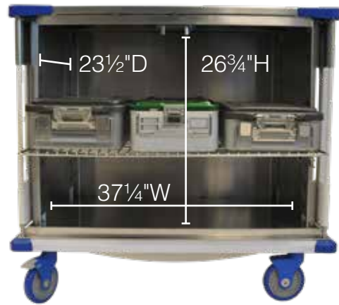
RCC-242 Inside Clearance Dimensions: 23½"D x 26¾"H x 37¼"W