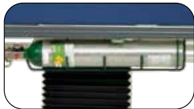
O 2 TANK HOLDER

Full length stainless steel side rails feature integrated push-pull handles with latch releases located at all four corners of the stretcher. Easy one-handed operation. No hinges, mechanical connections or plastic couplings to trap debris or fluid. Easy to wipe clean and disinfect.