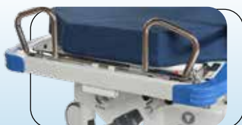
CUVERRO® PUSH/PULL HANDLES