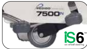
SIX WHEEL STEERING

Pedigo's ergonomic Quick-Release O 2 Tank Holder is side mounted and conveniently located under the patient surface to reduce caregiver bending.