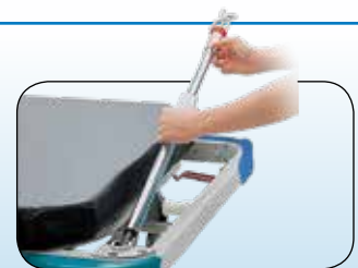
FOLD DOWN IV POLE