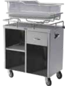
shown with optional bassinet and pad