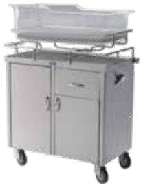
shown with optional bassinet and pad