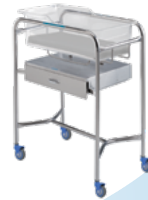
shown with optional bassinet and pad