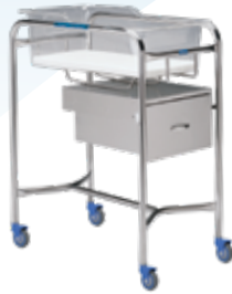
shown with optional bassinet and pad