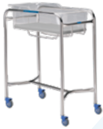
shown with optional bassinet and pad