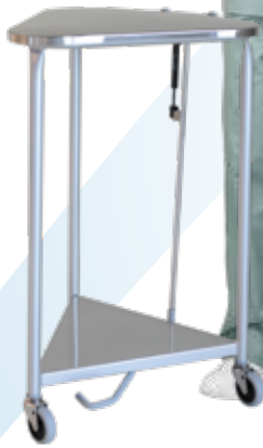
P-120-L and P-121-L

Linen hampers are constructed of heavy gauge steel and feature a triangular shape for efficient use of space. Double ball bearing 3" swivel casters make for easy mobility. Strong, heavy gauge shelf keeps bag from touching floor and simplifies bag removal.