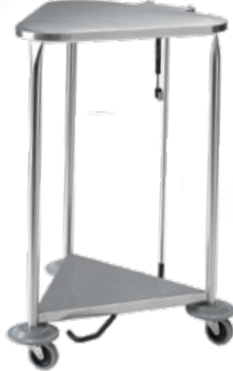
P-1120-L-SS and P-1121-L-SS