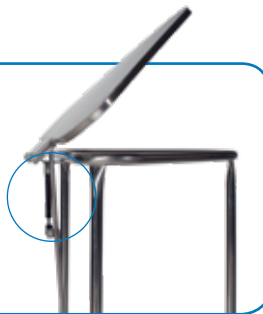
25" Bag Hamper Opening