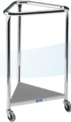
P-120 and P-121