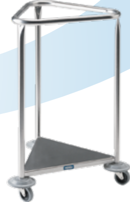
P-1120-SS and P-1121-SS