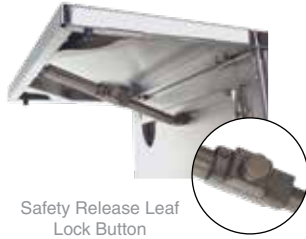
Safety Release Leaf Lock Button