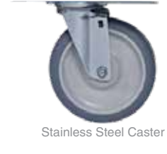
Stainless Steel Caster