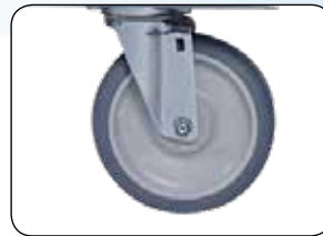
Stainless Steel Caster