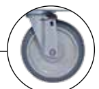
Swivel Plate Caster