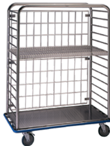
shown with optional accessories