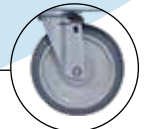
Swivel Plate Caster