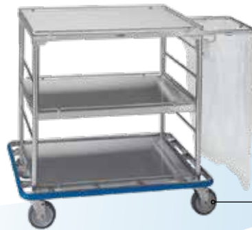
shown with optional ring