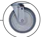
Swivel Plate Caster