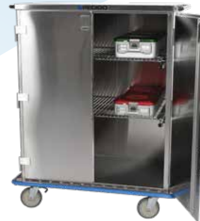
CDS-245 shown with optional shelves