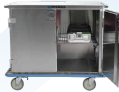
CDS-242 shown with optional shelves