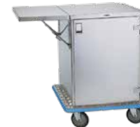
CDS-256-MS shown with optional drop leaf