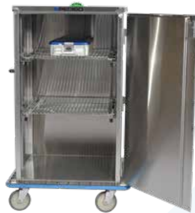
CDS-235 shown with optional shelves & CartStat