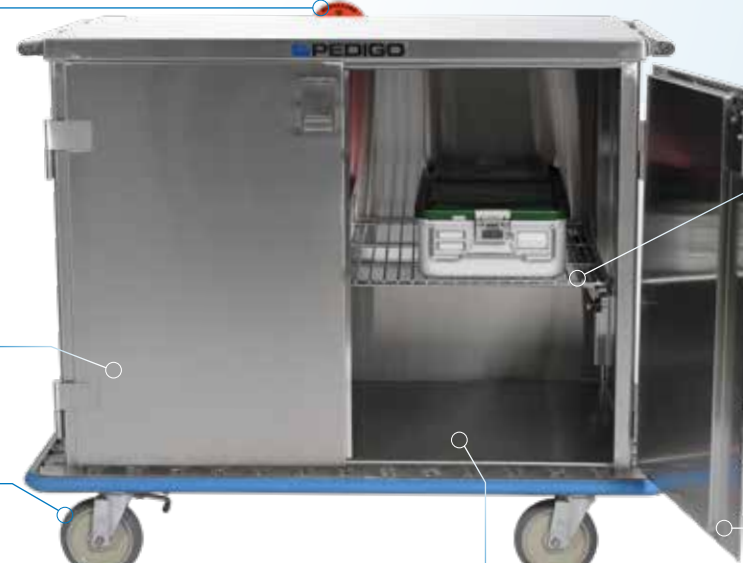
Stainless Steel Doors