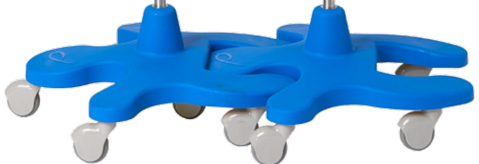
P-1090-CV Infusion Pump Stand

Designed for comfortable transport and storage of multiple stands.