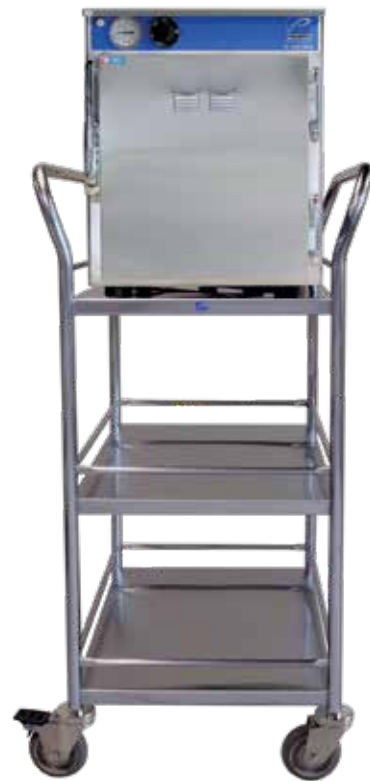
Shelf Dimensions 17"W x 27"D x 12¼"H

Warmers feature solid door and temperature control.