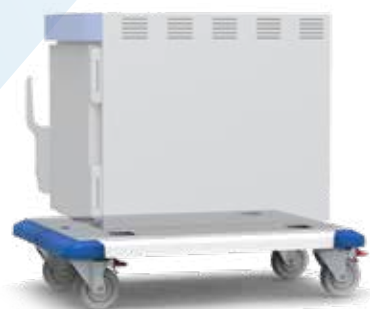
P-2010-CB shown with the P-2010-S warmer