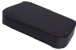
Head/Foot Extension Pad 3" Pad

* Can not be used if stretcher has patient bag hook installed.