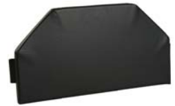
Push/Pull Bar Pad

* Can not be used if stretcher has patient bag hook installed.