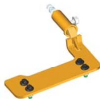
Trendelenburg Level Lock