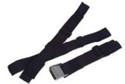
Restraint Straps Pair

Part No.: 59121001 (3" Pad) Part No.: 59122001 (4" Pad)