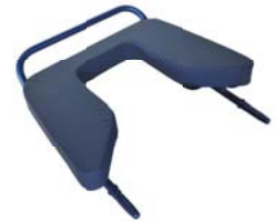
Head Rest Extension With Integrated Push Handle