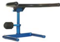
Surgeon Swivel Wrist Rest