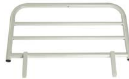
Push/Pull Bar Removable