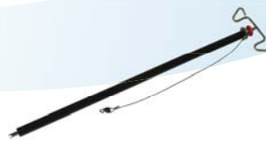
IV Pole Adjust