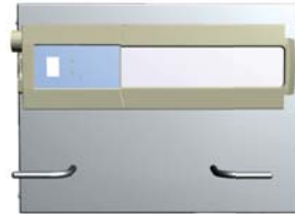
Battery Charging Station