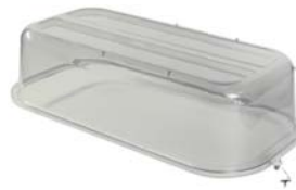
Security Top Translucent Smoke for Crib