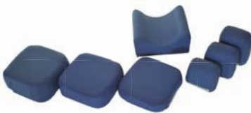
Complete 7 Piece Head & Neck Pad Kit