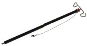
IV Pole Adjust