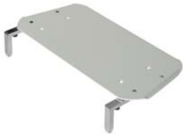
Head/Foot Extension Without Pad