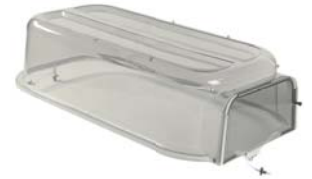
Security Top - Removable Translucent Smoke for Crib