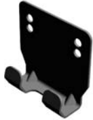
Storage Bag Hook

Part No.: 5107001 Includes 6 mounting clips