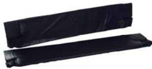
Siderail Pads Pair

Part No.: 5704001 (narrow) Part No.: 5705001 (wide)