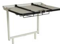
Monitor Tray Board w/ Chart Holder