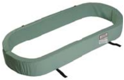
Siderail Bumper Pads Pediatric Crib