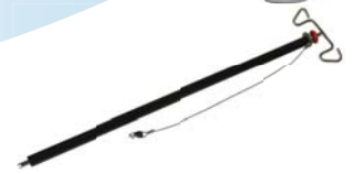
IV Pole Adjust