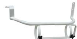
O 2 Holder