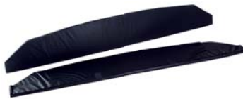
Siderail Pads Pair