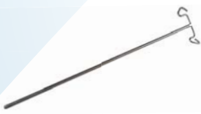
IV Pole Fixed height