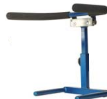
Surgeon Wrist Rest

Part No.: 750709 Part No.: 750709-1 (3" extension)