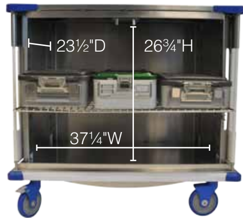
RCC-242 Inside Clearance Dimensions: 23½"D x 26¾"H x 37¼"W