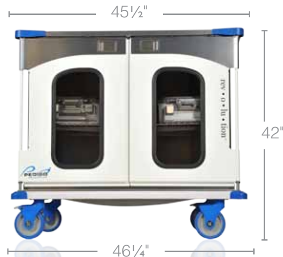
RCC-242 Outside Dimensions: 27½"D x 41½"H x 45½"W (top) / 46¼"W (bottom)