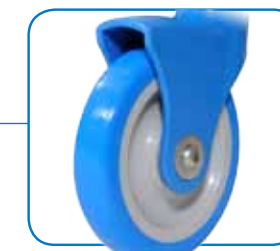
re • volve™ caster